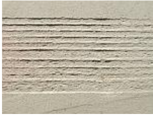
MILLING FLAIL PROFILE